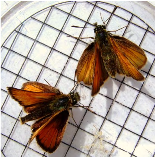
Female Essex skipper on left with a male Small skipper on its right.

the graph indicate high numbers in July and August. It is hoped to walk the path for another four years and show the changes in butterfly frequencies with global warming. The highlight was the finding and photographing of three uncommon species: